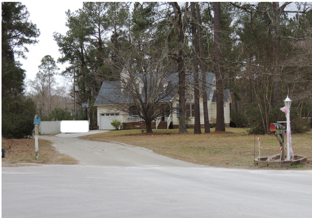
View of Gravel Access Road from Gull Pointe