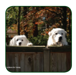
Registration is Required for all Dogs and Cats

For additional information and to make your inspection reservation, please call the River Bend Police Department at 638-1108. Click <u>HERE</u> for more information.