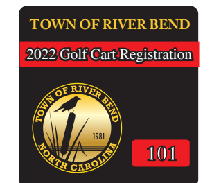
Golf Cart Registration

Town ordinances allow for residents to drive their properly equipped golf carts on River Bend streets provided that they are inspected by and registered with our Police Department. If you plan to drive your golf cart on the roadways, you must display the 2022 registration decal. Decals for 2022 were available beginning December 2, 2021.