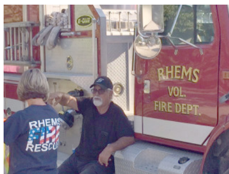
RHEMS VFD FIRE DEPARTMENT & FIRST RESPONDERS ALWAYS READY TO HELP