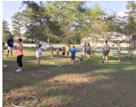
BOY SCOUTS LED CHILDREN'S GAMES WHILE EARNING BADGES

National Night Out is an annual nationwide community-building campaign promoting police-community partnerships and neighborhood camaraderie to make our neighborhoods safer, more caring places to live and work. This year, River Bend Community Watch hosted National Night Out in River Bend with the theme “River Bend’s Got Talent!”