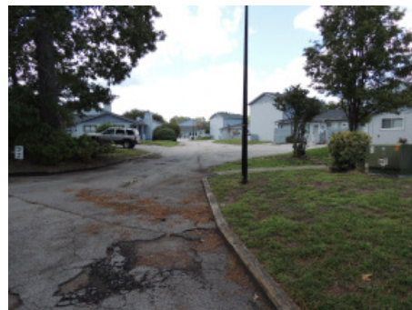
HARBOUR WALK - ONE YEAR LATER