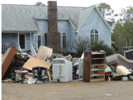
BOWLINE DRIVE IMMEDIATELY FOLLOWING HURRICANE FLORENCE

I repeat the opening statement that we all wish that every element of Hurricane Florence had already disappeared, but recovery is not a simple process and completion will not occur in the snap of a finger. ■