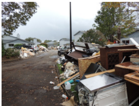
HARBOUR WALK IMMEDIATELY FOLLOWING HURRICANE FLORENCE