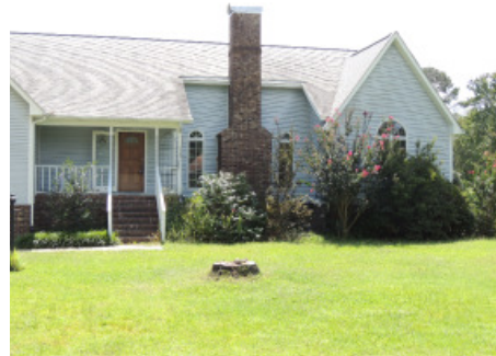
BOWLINE DRIVE - ONE YEAR LATER