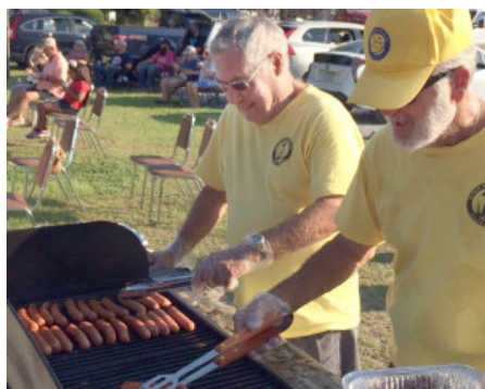
COMMUNITY WATCH - GRILLING TO FEED THE MASSES