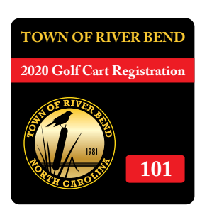
Golf Cart Registration

Town ordinances allow for residents to drive their properly equipped golf carts on River Bend streets provided that they are inspected by and registered with our Police Department. If you plan to drive your golf cart on the roadways, you must display the 2020 registration decal. Decals for 2020 will be available beginning December 2, 2019.