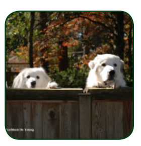
Registration is Required for all Dogs and Cats

For additional information and to make your inspection reservation, please call the River Bend Police Department at 638-1108.