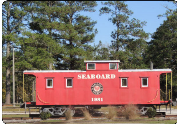
Caboose restored, 2009