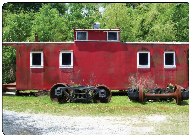
Caboose on blocks and on the ground, 2005

Our caboose is believed to have belonged to the Seaboard Coastline Railroad. That railroad operated on the east coast and had tracks between Jacksonville and