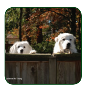
Registration is Required for all Dogs and Cats

For additional information and to make your inspection reservation, please call the River Bend Police Department at 638-1108. Click HERE for more information