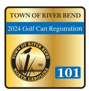
Golf Cart Registration

Town ordinances allow for residents to drive their properly equipped golf carts on River Bend streets provided that they are inspected by and registered with our Police Department. If you plan to drive your golf cart on the roadways, you must display the current year registration decal. Decals for 2024 are available now.