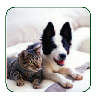
Pet I. D. Photos Now Available

2024 tags are available now at Town Hall.