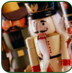
Toys for Tots SPONSORED BY USMC RESERVES

"please take this questionnaire seriously and return it promptly. It is your input that will help guide us in our decision-making process..."