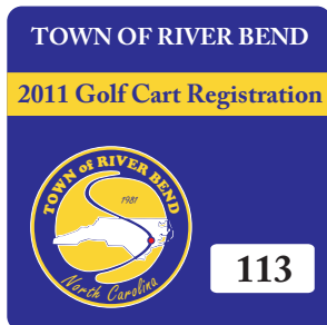
2011 Golf Cart Registration Due in November

The United States Marine Corps Reserve has placed a Toys for Tots collection box in Town Hall. Each year the US Marine Corps Reserve collects new toys for distribution to children who might otherwise not receive any gifts at all for Christmas. If you'd like to help with this good cause, please place a new, unwrapped toy in the collection box. For additional information, please visit the official web site at www.toysfortots.org . ●